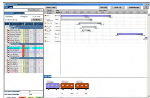
Consolidated view of multi-type land dispatch operations